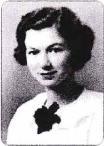
UC Berkely yearbook picture, class of '38